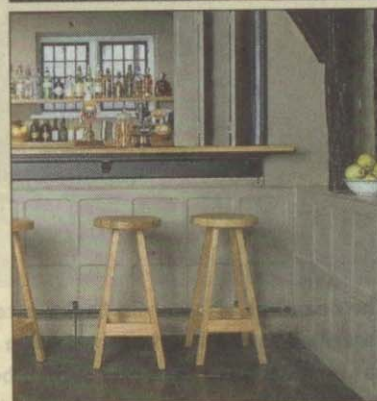
The Crown dates from the 16th century, but boasts 21st-century comforts.

own 21st-century songs, via Mozart, the Beatles and Crowded House. It's hugely convivial, and we tear ourselves away from our table by the log fire in the bar to one near the fire in the dining room. (It is a very cold night.)